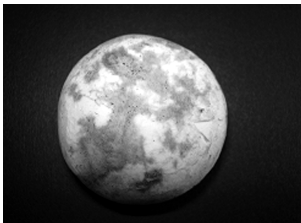
Fig. 1. Spotting of Agaricus bisporus cap artificially induced by Verticillium fungicola var. fungicola VV2.