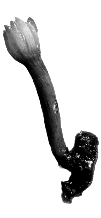
Fig. 2. Germinated embryo of Pinus heldreichii grown on medium without salts and vitamins (0GD).

The addition of organic nitrogen in the form of enzymatic casein hydrolyzate in the medium did not increase germination percentage, but promoted the growth of hypocotyl and cotyledons at concentrations from 250 to 500 mg l^{-1} (data not shown).