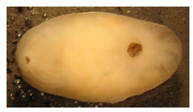
Fig. 1. Stichorchis subtriquetrus – ventral view.