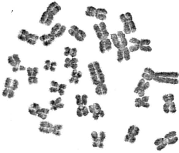
Fig. 1. Metaphase plate of G. subgutturosa from Turkey (Female, 2n = 30 ).