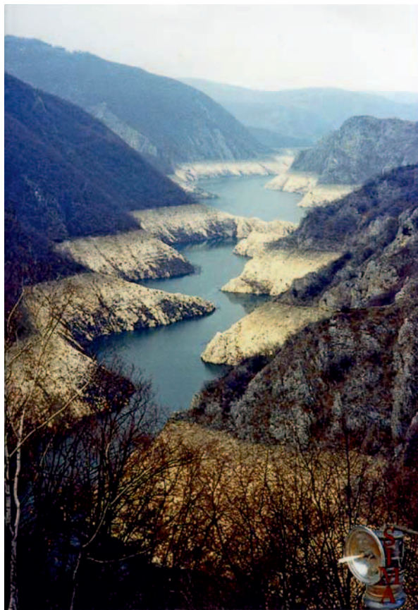
Figure 3. Photograph of the Uvac river canyon.

According to the results of Taler (1944), graylings also occur in the Jadar and Drinjača