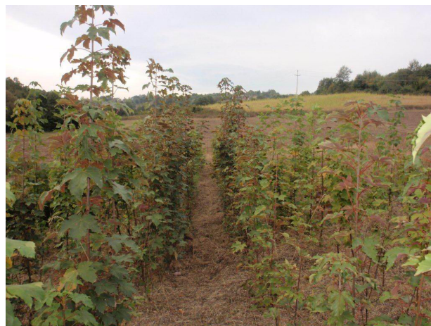
Fig. 1: Five-year old Acer pseudoplatanus 'Atropurpureum' plants, during field experiment (Ljig, September 2010)

In the fall of 2010 when they were five years old (Fig. 1), the variability of the plants' morphometric properties was subjected to analysis: height (cm) and diameter at the neck of the root (mm). The phenotypical expressions of purple, green and variegated leaf undersides were also analyzed for every half-sib line. The research covered seven half-sib lines because lines 1 and 6 had declined to a negligible numbers of individuals. In order to facilitate the statistical data processing, the plants with leaves with green undersides were marked 1, purple - 2, and variegated - 3. The research dealt with a sample of 30 individu-