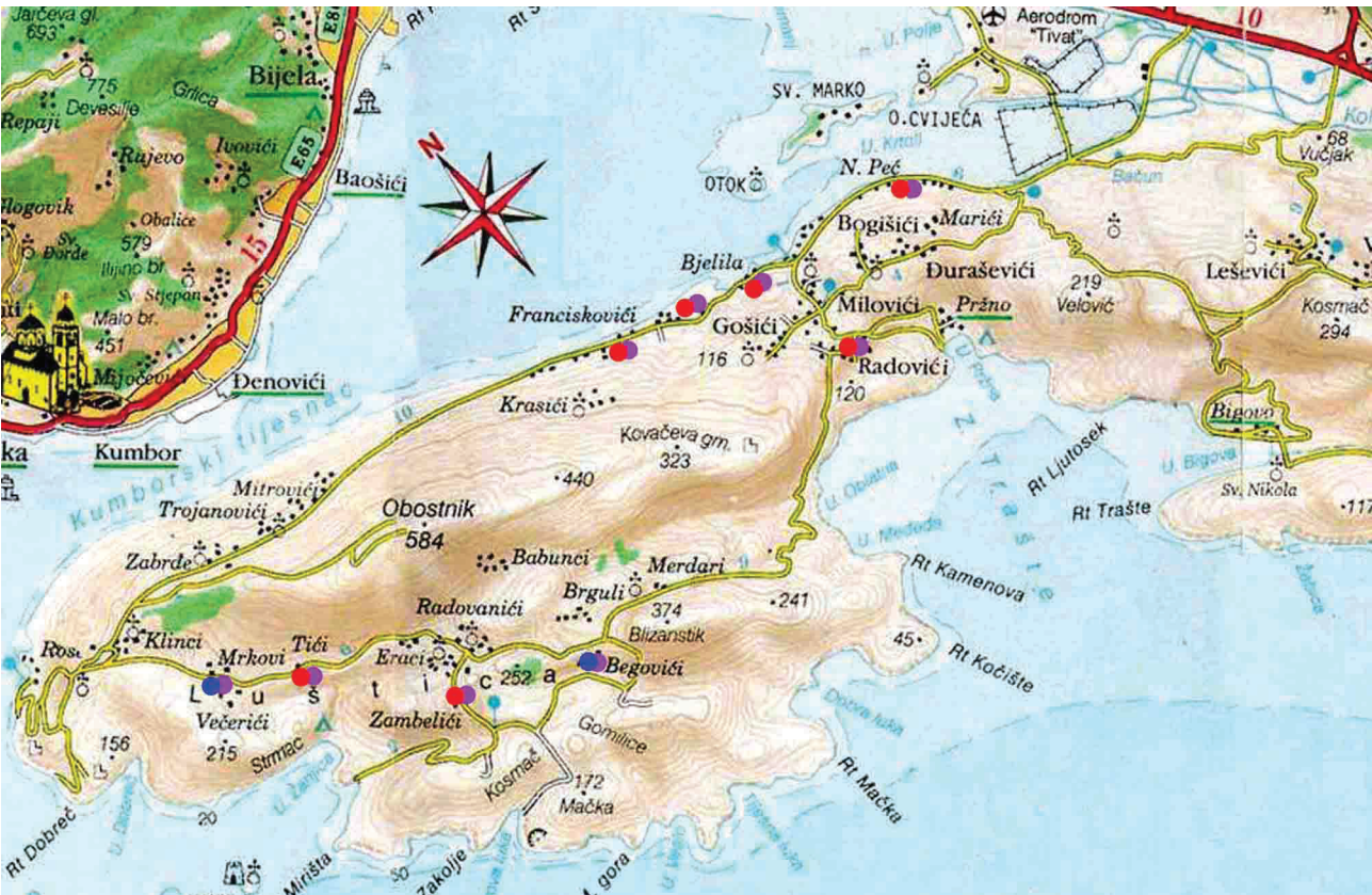
Fig. 2. Luštica peninsula and sites monitored in 2011-2012.