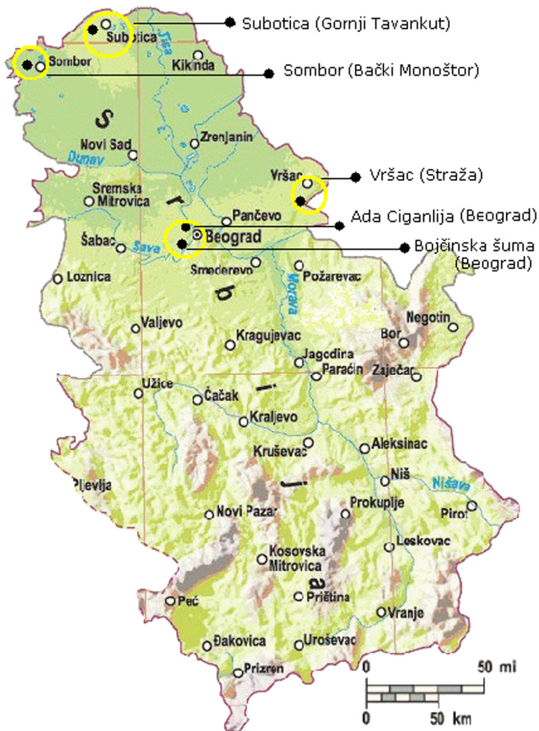
Fig. 1. The map of sampling populations of Quercus robur L. in northern Serbia ( www.melnica.com/slike/Srbija_karta.gif ) (mod. Batos, 2008).