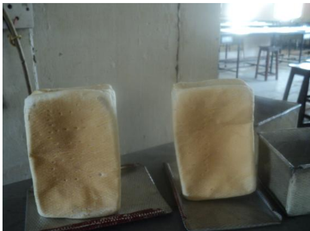
Plate 1. Bread containing 0g of fiber content (control)