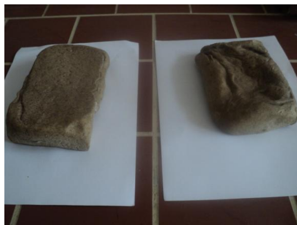
Plate 4. Bread containing 1g of fiber content

with different levels of fibers and that the weights of the rats in the control group were significantly different from those of rats in the other groups. From the pairwise comparison, it can also be concluded that the weights of the rats in the other three feeding groups (feeds with wood fibers) were not significantly different from one another. With this, it might be inferred that wood fiber can prevent the occurrence of obesity, as earlier reported by Sungso and Diche (2001).