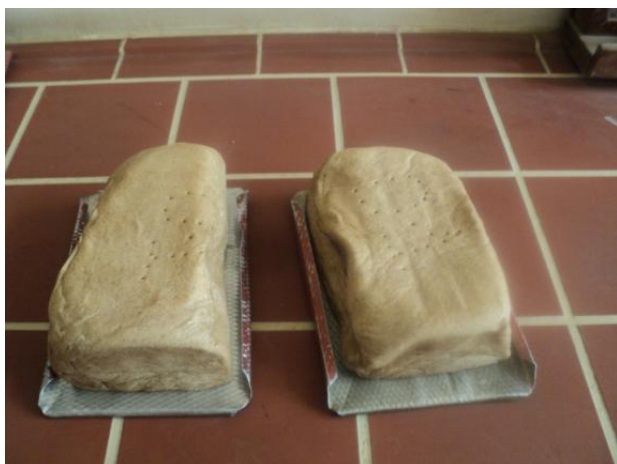
Plate 3. Bread containing 0.5g of fiber content