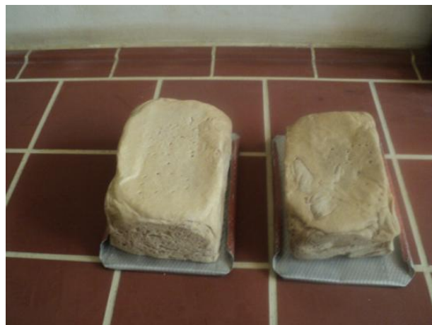
Plate 2. Bread containing 0.25g of fiber content